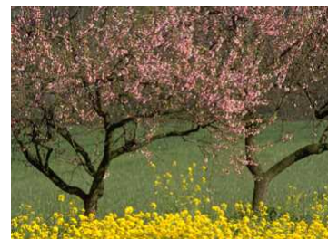
View from the Window

like to be involved in this sub group please give your name to Alice and we'll get back in touch with you to let you know the date of the first meeting of the group.